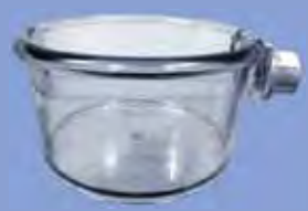
#4307 40 oz (1183mL) 7" Diameter