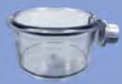
#4305 20 oz (592mL) 6" Diameter