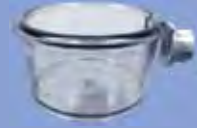
#4303 15 oz (444mL) 5" Diameter