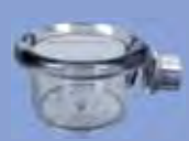
#4301 5 oz (148mL) 4" Diameter